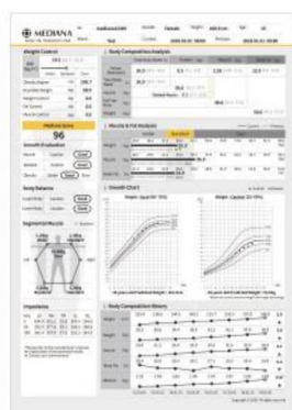
<Children Result Sheet>

* Due to continuing product innovation, Specifications may change without prior notice.