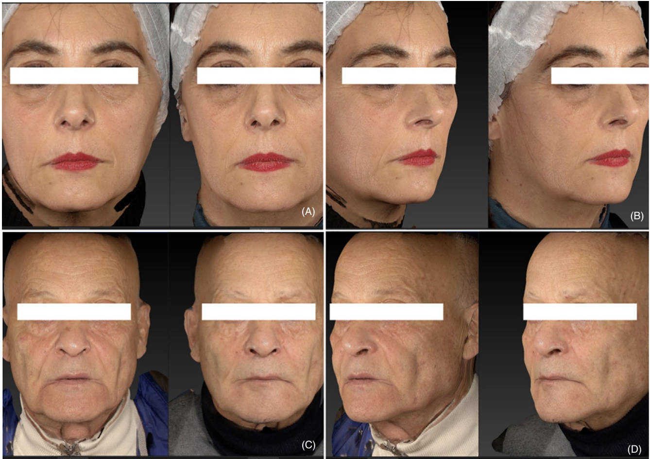
FIGURE 2 A, Frontal view, after and before treatment with 675nm laser B, detail of the improvement of nasolabial folds and jawline area. C,D, Frontal and later view; in the zygomatic area, reduction of deep wrinkles can be observed

10 men) with an mean age of 52 years (range 47-66) treated with two sessions at 30 days apart from each other.